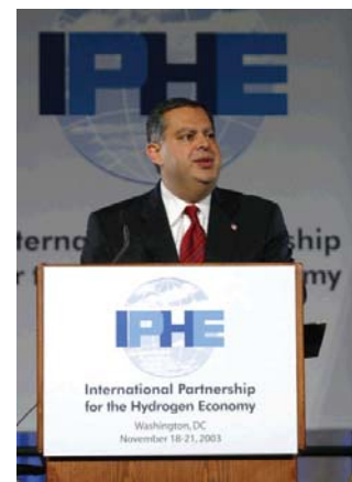
U. S. Secretary of Energy Spencer Abraham speaking at the IPHE Meeting: "Through this Partnership, we have established a comprehensive framework on which to structure global hydrogen research and development. We can begin to take steps ... toward our ultimate goal – a secure, environmentally friendly energy future."

In November 2003, energy ministers from 16 countries representing 85% of the world gross domestic product joined to create the IPHE, an important global effort to maximize collaborative partnerships among countries and to promote sharing of experiential and research results.